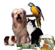
Blessing of the Animals!

Have you lost a beloved pet or are unable to bring your pet with you, please bring a photo to remember and honor them, and receive a blessing.