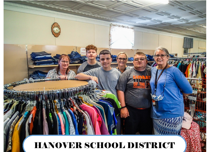
HANOVER SCHOOL DISTRICT